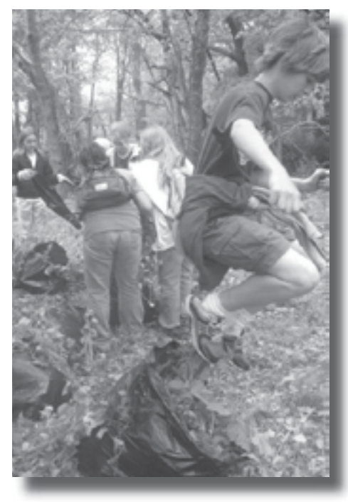
Stamping out garlic mustard at Skiles Test Park.

kids interested in the natural world. At the end of the event, I was tired, slightly hoarse, but deeply satisfied with how the day had gone.